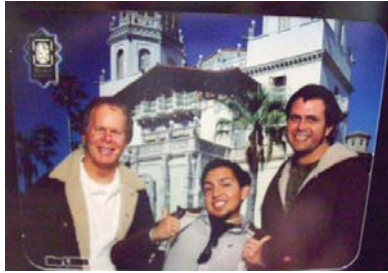
The OC LAFCo staff at work raising issues no one else will!

transferable County revenue and non-conforming land uses (e.g., medical marijuana dispensaries). With consultant assistance, we are developing a fiscal model which will project how much revenue the County will need to transfer (i.e., sweeten the “pot” – no pun intended) to make it a win-win for both the County and the city over time.