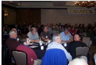
Participants engaged in general sessions