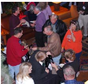
Annual Wine & Beer Competition provides valuable networking time, and some pretty good California wine and beer too!