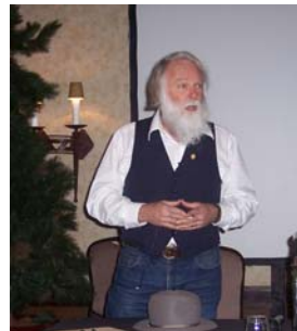
'John Muir' shares the history of Yosemite with participants